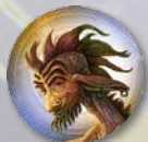
SWINDLER TOKEN BACK

These tokens are only used when playing with the Swindler alien. Six of these tokens are blank and one is marked with an "X" on its front to indicate which player is the Swindler's "mark." Their use is completely described on the Swindler alien sheet.