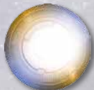
SWINDLER TOKEN FRONT